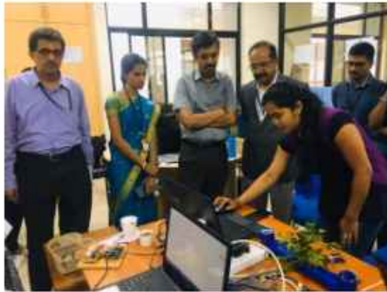
Student demonstrating the project to Principal