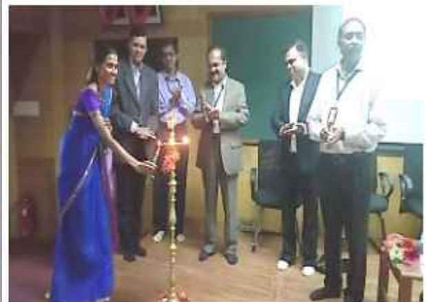
Lighting of Lamp by the Dignitaries