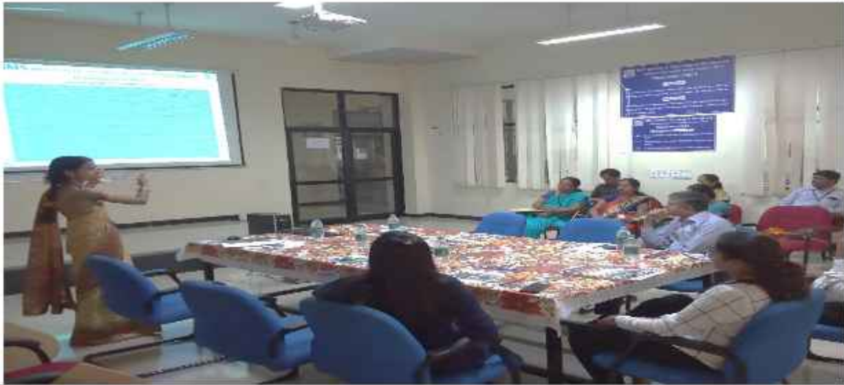
HoD presenting the progress and compliance steps since the last meeting