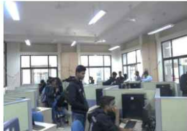
Students participating in the events