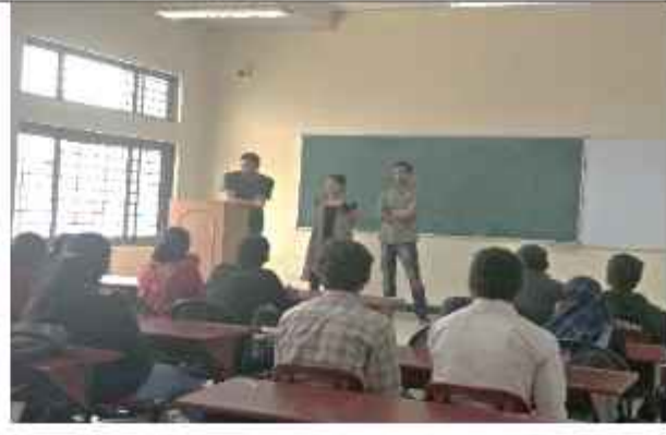
Alumni interacting with students