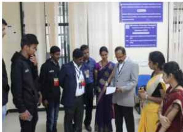
Principal with the fest coordinators

Technix3.0 is a department fest organized by Department of MCA for UG and PG students. There were 7 events such as IT Quiz and coding, typathon, IT Hunt, video making, technical memes, paper presentation and stress manager. The program started with IT Quiz consisting of 9 teams following the inaugural function. Then the events namely typathon, IT Hunt, and stress manager were conducted which were judged by the faculty members of the department. One more interesting event was video making event where the students has shot the entire event video and edited it to play for 4 minutes by using video editing tool.