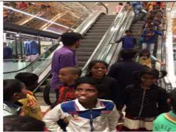
Hard to capture moment of children's happiness after the movie screening