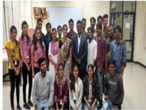
Participants of the Hands-on Sessions