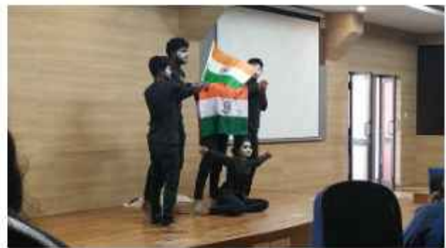
Students of Dept. of MCA performing on 15 th August, 2019