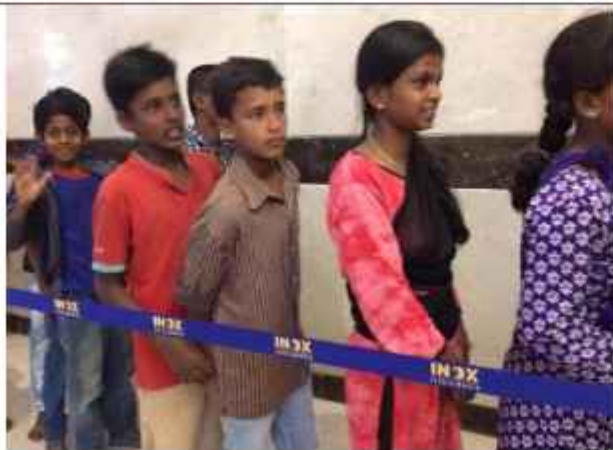
Children lined up eagerly waiting to meet the Lion King