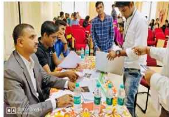
Judges at the Open Day event