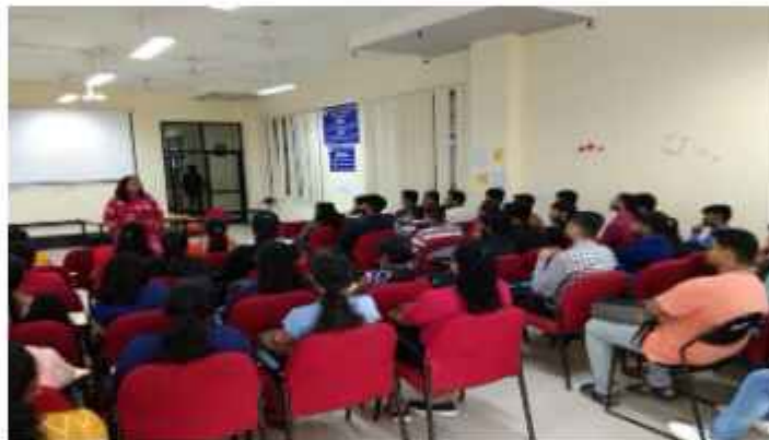
Alumni talking to the students on industry requirements